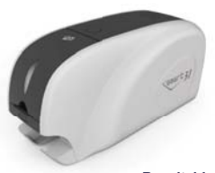
Rewritable ID CARD PRINTER smart-31 R