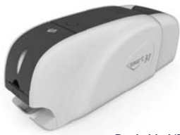
Dual sided ID CARD PRINTER smart-31 D