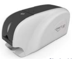
Single sided ID CARD PRINTER smart-31 S